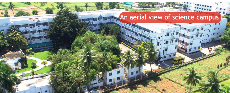
An aerial view of science campus

(Affiliated to Bharathiar University, Coimbatore) (Re-Accredited by NAAC with 'B+' Grade) Koorapalayam Pirivu, Pichandampalayam (PO), Erode - 638052. Ph.: AO ; 73737 24422 | E-mail : nandhaarts@gmail.com