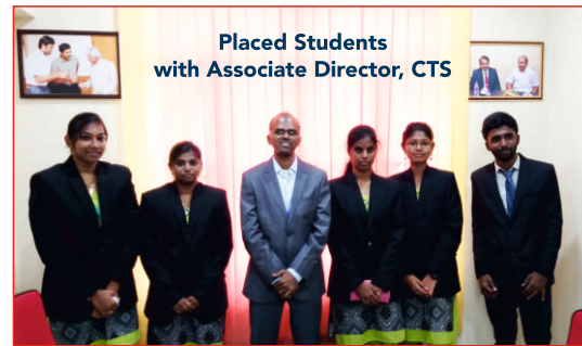
Placed Students with Associate Director, CTS