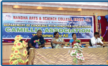
Camellia Association Inaugural